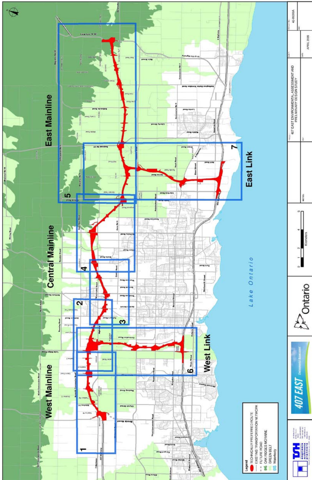
Exhibit 1-1 Transportation Corridor Footprint / Sections